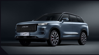
Olive Grey and Black