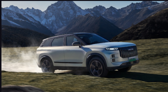
7 Driving Modes

The Jaecoo J7 exudes sophistication, inside and out. It delivers both power and premium aesthetics, making every journey effortless. Subtle yet striking, the retractable handles showcase fluid design harmony. A true mark of classic elegance, Jaecoo’s signature Waterfall Grille features bold vertical chrome bars, adding to its distinctive presence.