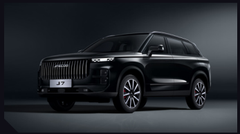
Carbon Crystal Black