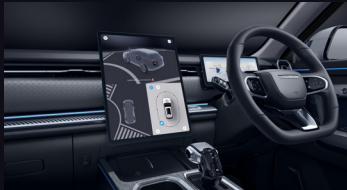
540° Panoramic Image