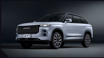
Moonlight Silver and Black