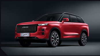
Black and Red